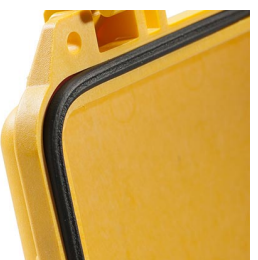
1703 Replacement O-ring