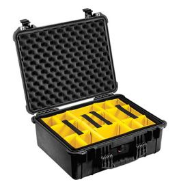
1554 With Padded Dividers